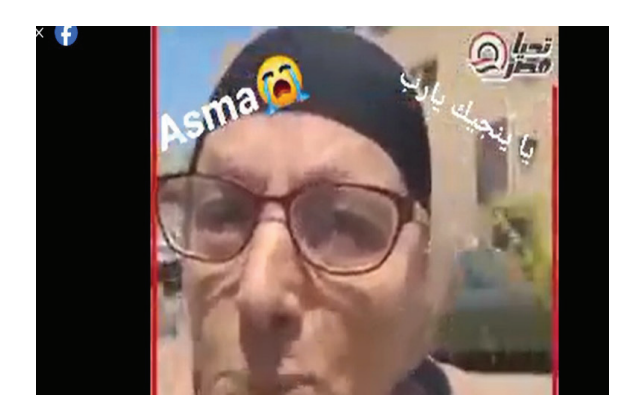
Fig. 3 screenshot of a video scene taken from a Vox pop with a woman who showed support to Mohamed Adel and the text was a repetition of her prayers to God to save Mohamed Adel from the death penalty.

There was a considerable number of videos and posts starting from the 1<sup>st</sup> of January 2023, as the users were waiting for the court verdict with regards to Mohamed Adel's objection on the death penalty verdict in February, reaching a frequency of four video posts per day. The videos were different in terms of form: some were edited as song video clips, including songs about injustice over Mohamed Adel's photos in the court; other videos were recorded by people who claimed they were friends of Naira. In these videos they accused her of misconduct, showing photos of Naira next to strangers with their arms around her.